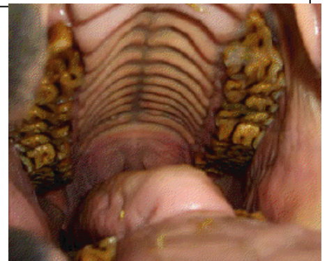
The inside of a horse's mouth, showing the upper cheek teeth.